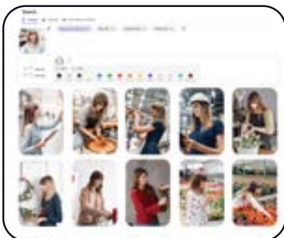
People* & vehicle attribute search