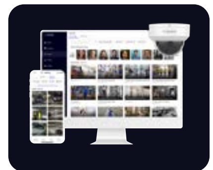
Customized smart alerts anywhere using Vision apps